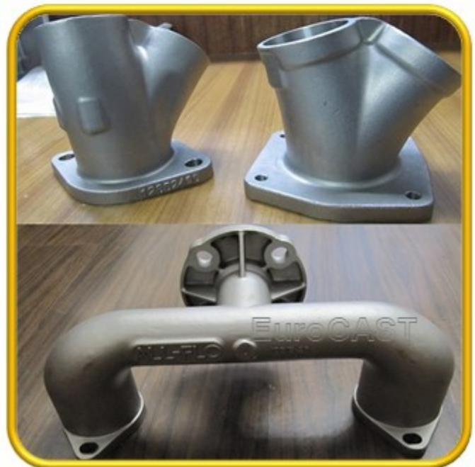
Investment Casting of pipe fitting & pipe connector