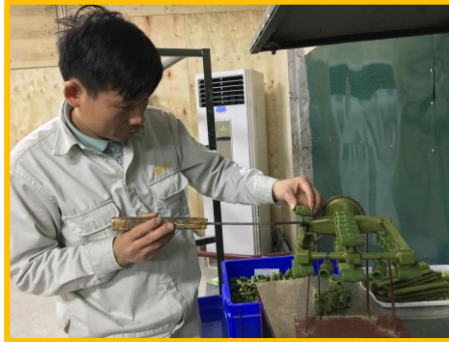
2. WAX ASSEMBLY