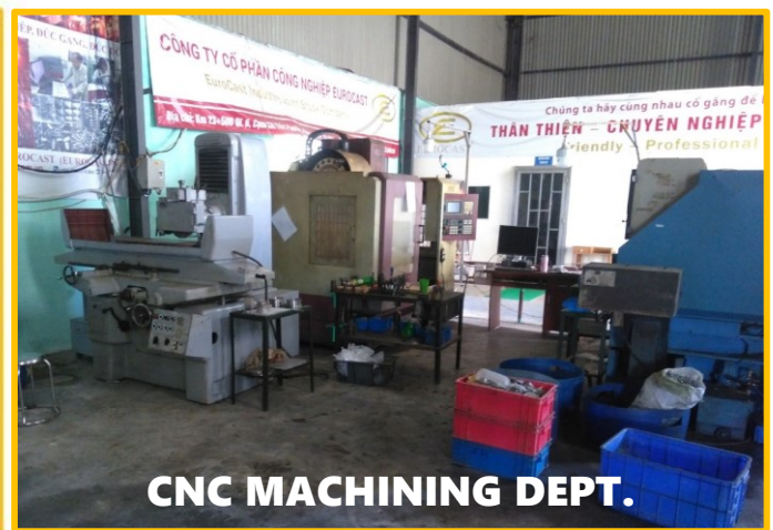
CNC MACHINING DEPT.