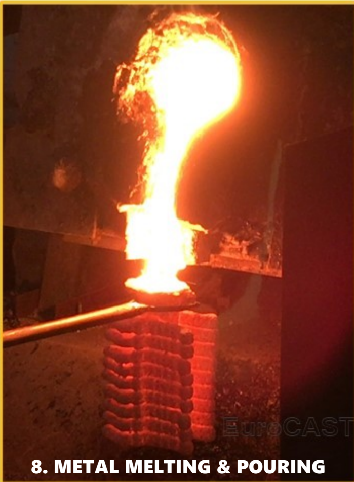
8. METAL MELTING & POURING