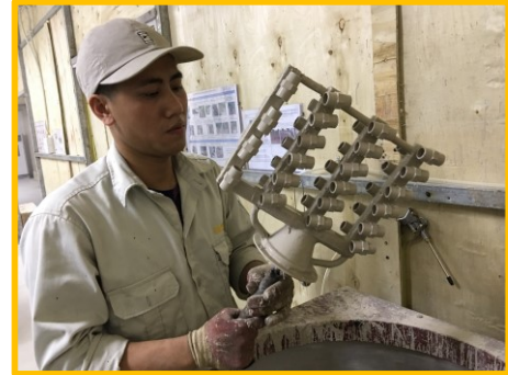
3. SHELL MAKING