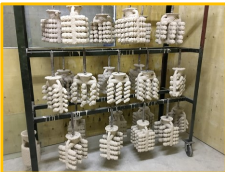
4. SHELL DRYING