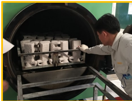
5. WAX REMOVING