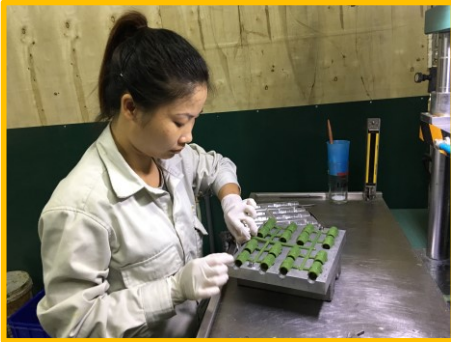
1. WAX INJECTION