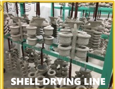
SHELL DRYING LINE