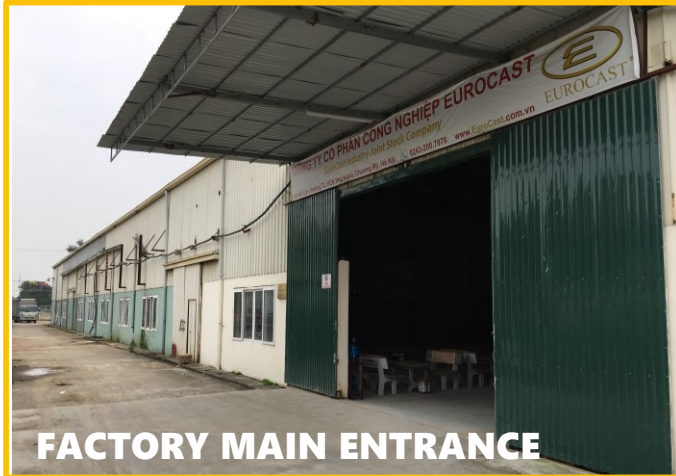
FACTORY MAIN ENTRANCE