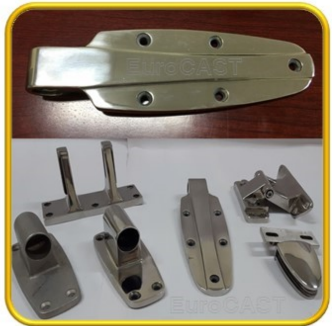
Investment Casting of glass hinges & bathroom parts