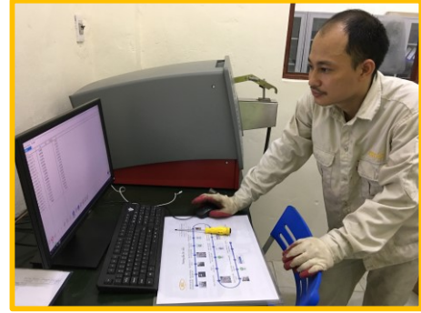
6. SPECTRO ANALYSIS