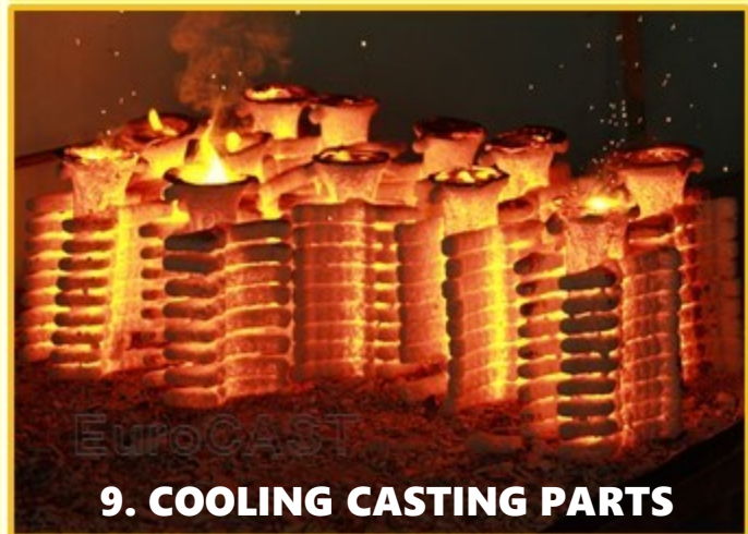
9. COOLING CASTING PARTS