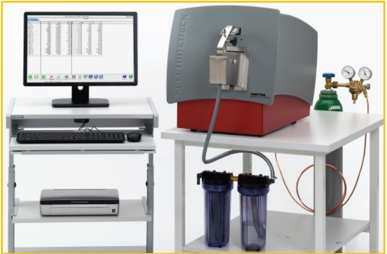
SPECTRO ANALYSIS FOR MATERIAL COMPOSITION ANALYSIS