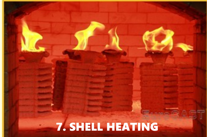
7. SHELL HEATING