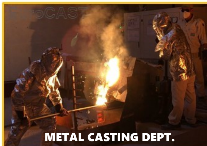
METAL CASTING DEPT.